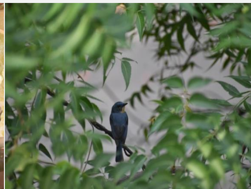
- Abhiram Koushik(2<sup>nd</sup> year)